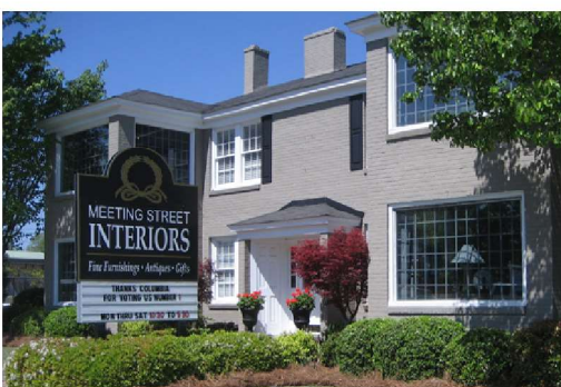
Meeting Street Interiors, 614 Meeting Street

Meeting Street Interiors is the epitome of elegance in home décor. It has been at 614 Meeting Street, West Columbia, since 1998.