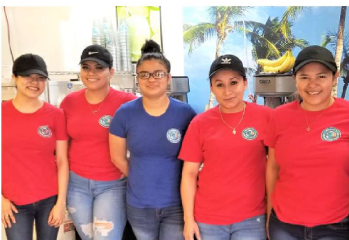
Manny's dedicated staff.

A trip to Manny's puts a smile on any kid's face. A lot of adults love Manny's, too.