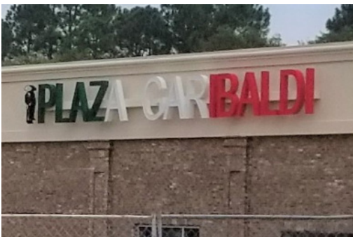
Plaza Garibaldi, Augusta Road at Jarvis Klapman Blvd

Over the past few years, many new businesses have found a home in West Columbia, with more on the way. Business licenses issued by the City of West Columbia in 2021 have outpaced the rate in 2020.