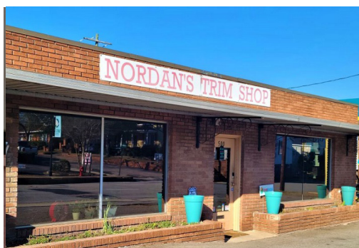
Nordan's Trim shop - 500 Meeting Street.

Nordan's Trim Shop has been serving West Columbia for 70 years.