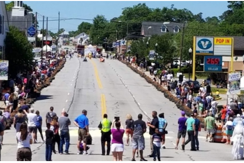
West Columbia's Kinetic Derby Day is April 23.

It's going to be big! West Columbia's Third Annual Kinetic Derby Day is Saturday, April 23, 2022, from 10 AM - 3:30 PM.