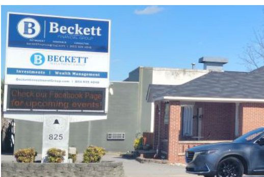
Beckett Financial Group at 825 Meeting Street

Beckett Financial Group is located at 825 Meeting Street in West Columbia and is owned by JB Beckett.