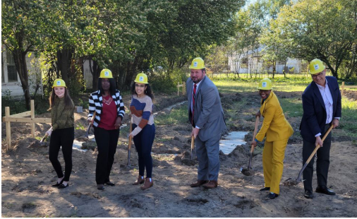
Groundbreaking for new home on Monticello Street Build in South Carolina since 2019.