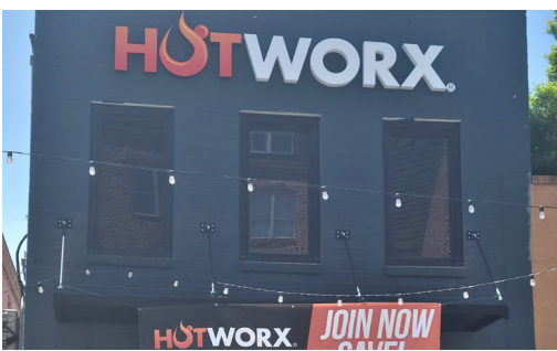
HOTWORX at 114 State Street

HOTWORX offers members unlimited, 24-hour access to a variety of virtually instructed, infrared sauna workouts. Members experience a combination of heat, infrared energy, and exercise. It's a workout program for people who want to flush toxins from their bodies, increase flexibility, balance, and tone, and burn a massive amount of calories in the process.