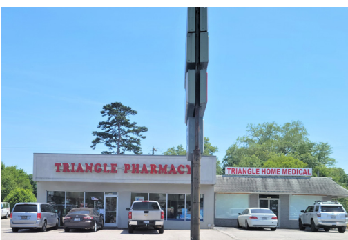
Triangle Pharmacy at 1239 D Ave.