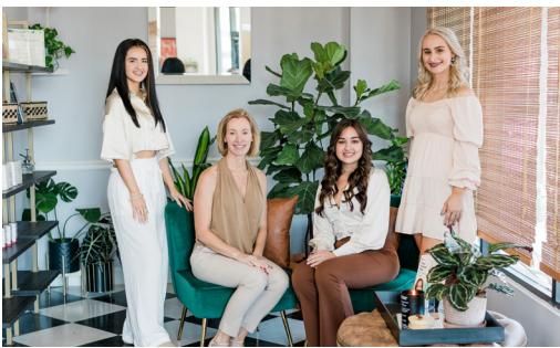
Staff of About Face at 519 Meeting St.

About Face Medical and Wellness Spa, at 519 Meeting Street, will celebrate its first anniversary on August 26, 2023.