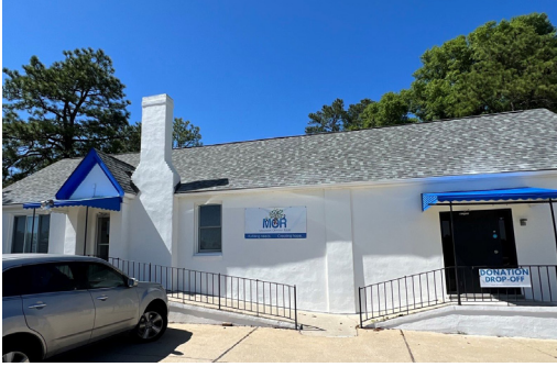
Midlands Orphan Relief at 1332 D Avenue Columbia from Downtown Columbia. The organization's service area is Lexington, Richland, Newberry, and Fairfield Counties.

There is a new good works operation in West Columbia. Midlands Orphan Relief moved into a building at 1332 D Avenue in January of 2023. The vision of Midlands Orphan Relief is that no child should be without the basic necessities in life, regardless of their life circumstances.