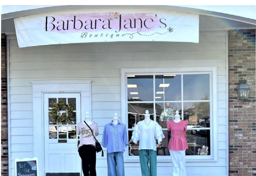
Barbara Jane's Boutique, 1505 Charleston Highway "We wanted to offer clothing and accessories that you could not find at other retail outlets," she said.