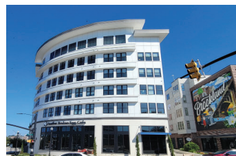
Another Broken Egg and 4West, State and Meeting.

4West, the latest phase of the Brookland Development, is now open for business at the corner of State and Meeting Streets in West Columbia.