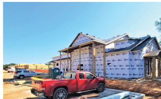
Langley Point under construction off Sunset Blvd.

Big things are happening in West Columbia, and an expansion to the city's infrastructure is helping to spur that development.