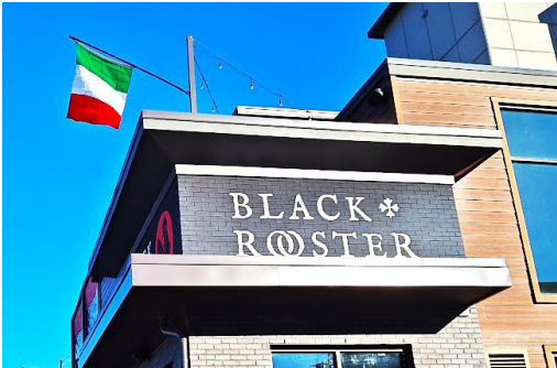
Black Rooster flying the Italian flag.

“With the closing of Al’s upstairs. I felt it was a perfect opportunity to change the menu and give West Columbia a casual upscale place for Italian. I think everybody has an interest in Italian, much more so than French, which seems to be a bit daunting to many diners. Even though French is ubiquitous in our everyday meals in America, I think a lot of people think it is fancy and only for special occasions. Italian, on the other hand, is much more approachable.”